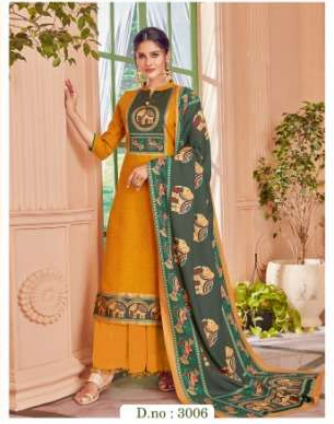
D.no : 3006