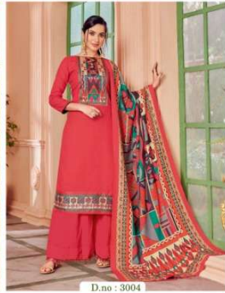
D.no : 3004