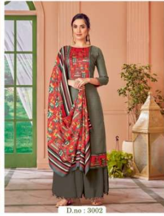
D.no : 3002