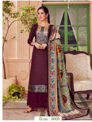
D.no : 3005