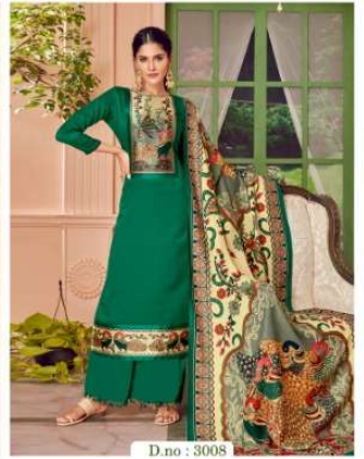
D.no : 3008