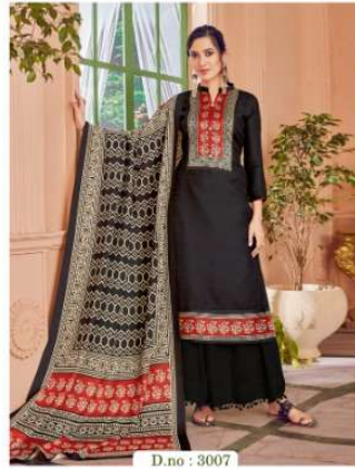
D.no : 3007