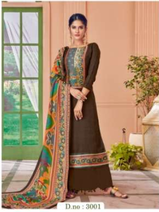
D.no : 3001