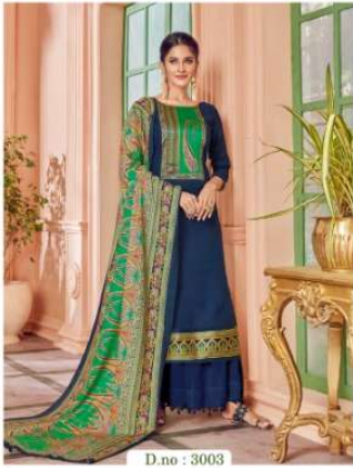
D.no : 3003