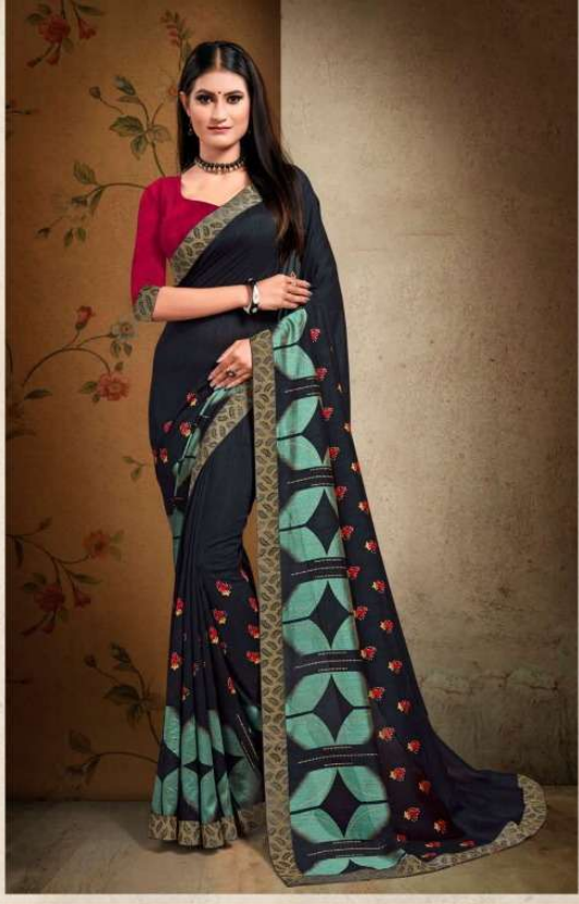
Looking good and feeling well is a whole lot more powerful. Good and feeling well is a whole lot more powerful.