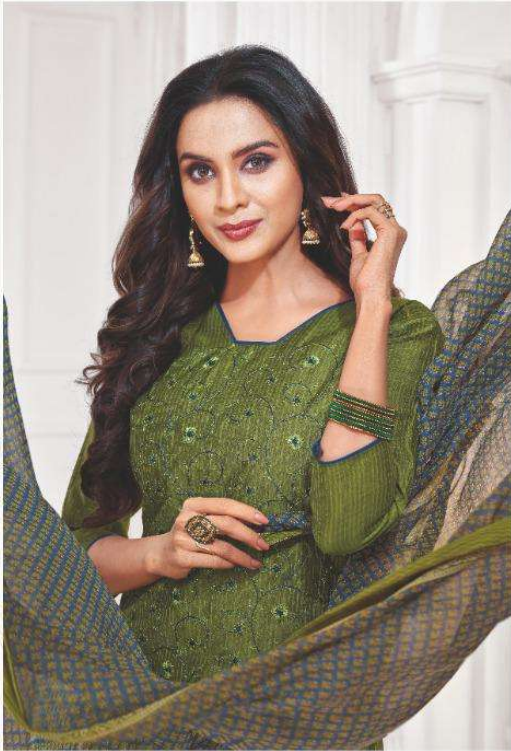
IT HAS A CLASSIC TIMELESS APPEAL THAT HAS STOOD TALL