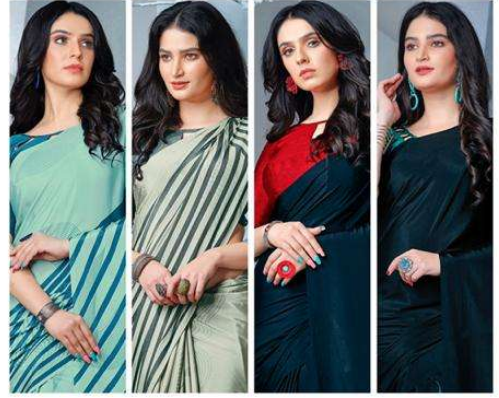
9103 A 9103 B 9105 A 9105 B