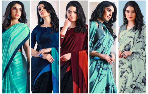
9003 A 9005 A 9005 B 9008 A 9008 B