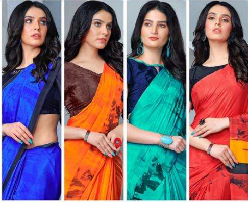
9101 A 9102 A 9102 B 9102 C