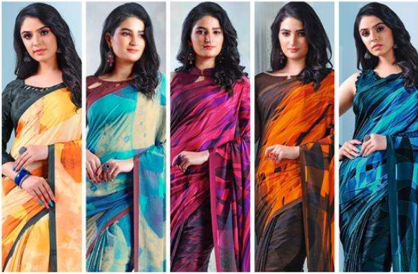
9001 A 9001 B 9002 A 9002 B 9002 C