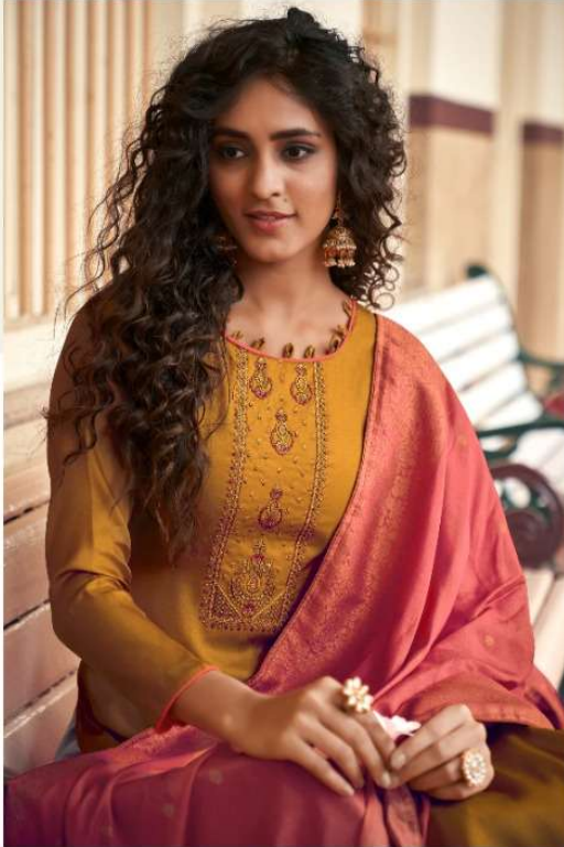
D. No. 3992