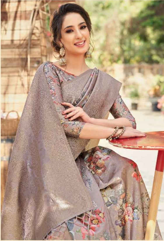
Bring out your inner diva with this chic and stylish collection of designs based on highly intricate embroidery.