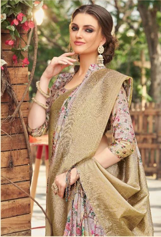
IT HAS A CERTAIN TRADITIONAL MIX ALONG WITH THE MODERN TOUCH WHICH DOES WONDERS FOR YOUR OVERALL FASHIONABLE LOOK.