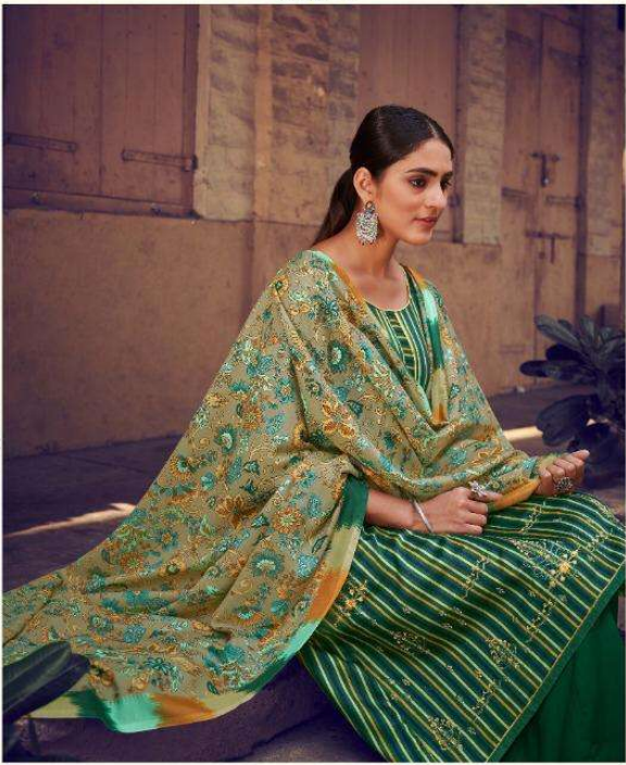
Impact appeal to your street chic style with a variety of patch work and patch work prints in dresses. 201-006