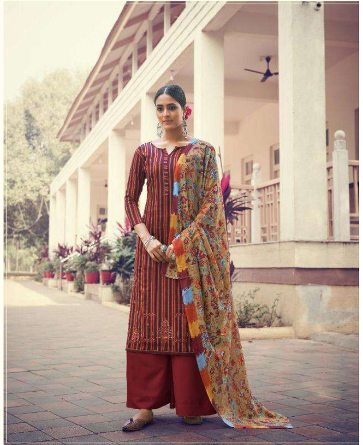
Inject appeal to your street chic style with a motley of patch work and patch work prints in dresses. 201-005