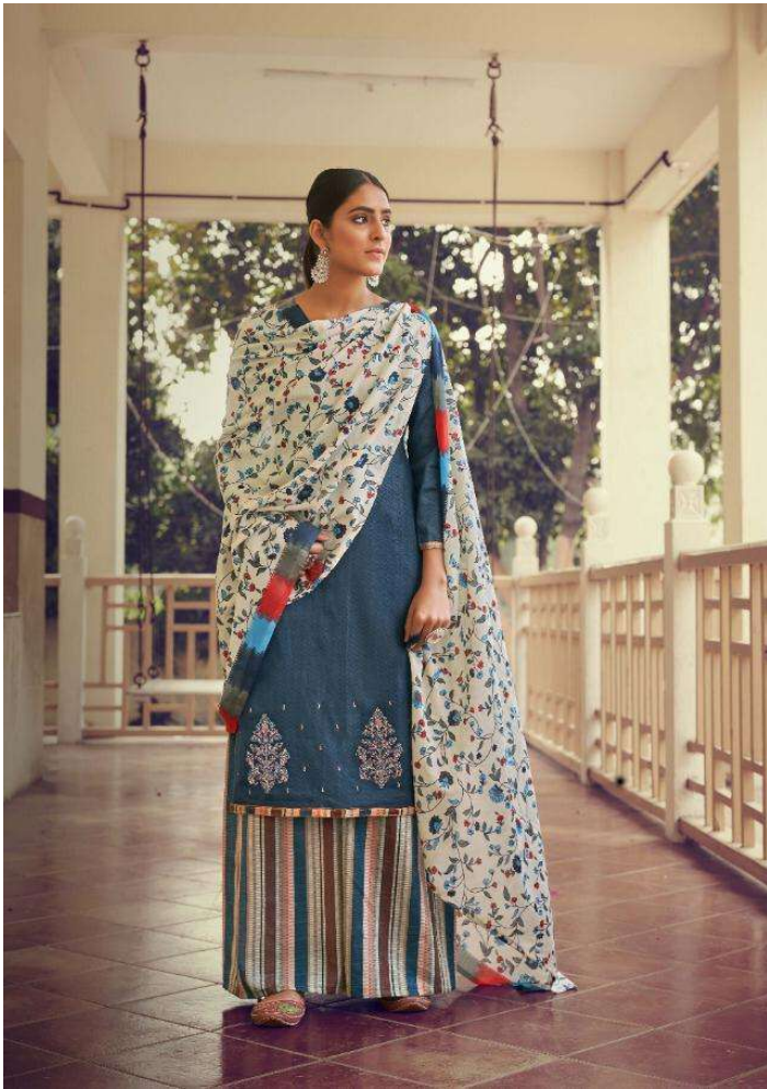
201-001 Impact appeal to your street chic style with a morley of patch work and patch work prints in dresses.