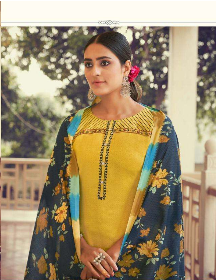
Impact appeal to your street chic style with a monney of patch work and patch work prints in dresses 201-002