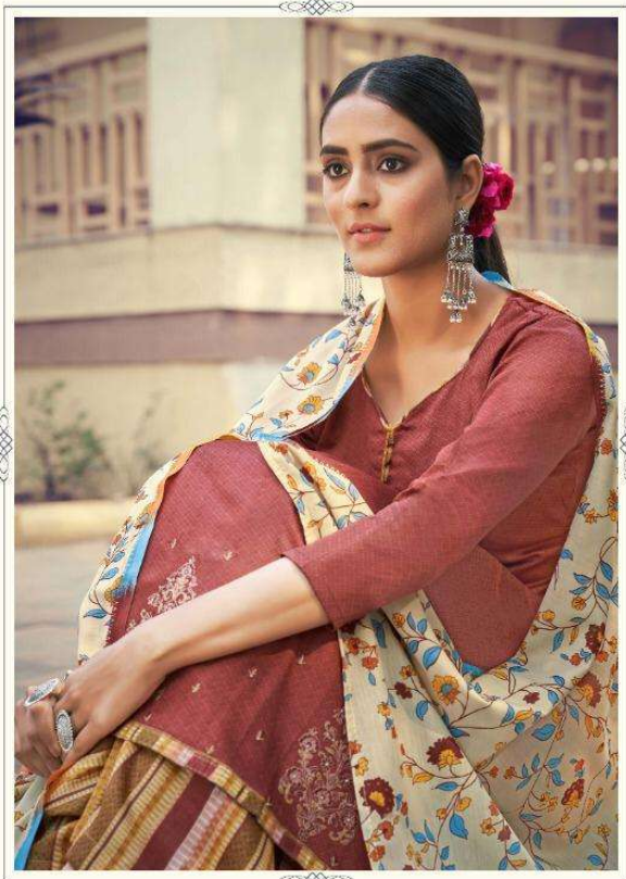
Impact appeal to your street chic style with a montage of patch work and patch work prints in dresses.