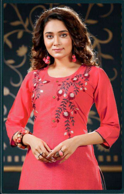
stand attention for styles latest construction, combination pattern with collection makes it reliable.