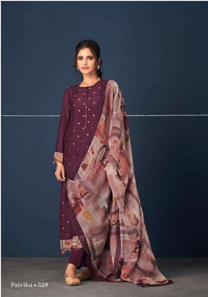
Patrika • 328