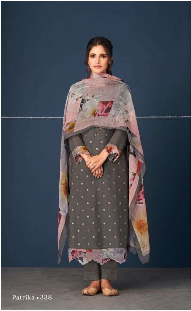
Patrika • 338