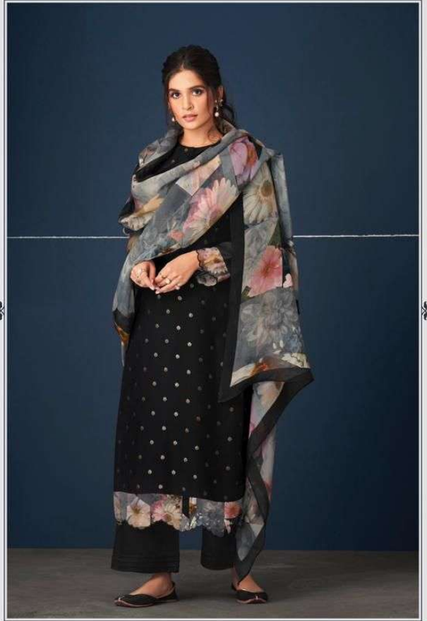
Patrika • 386