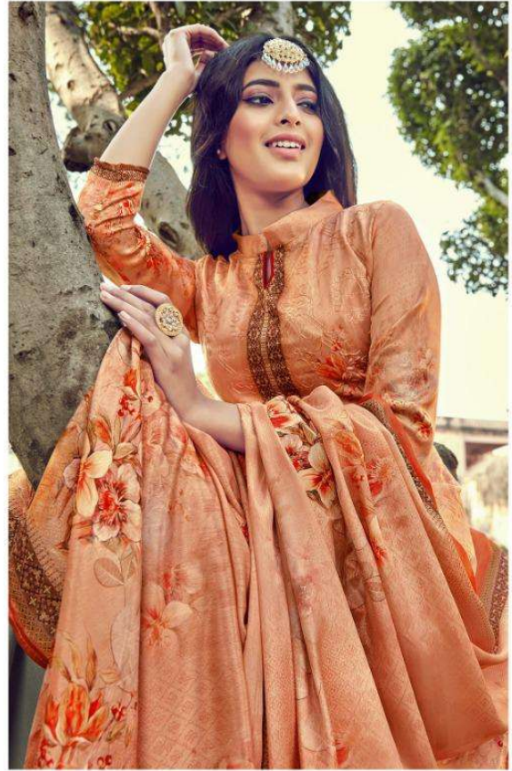
Get new collection in your wardrobe. Now the Style, One step closer to Perfection wear your look gets better definition with just a Little Attention to Detail.