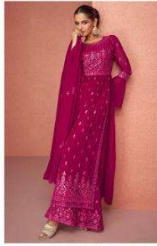
◆ 9395 ◆