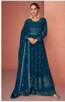
◆ 9396 ◆