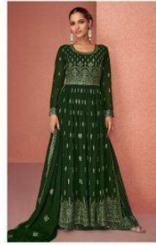
◆ 9398 ◆