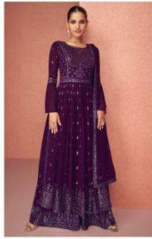
◆ 9397 ◆