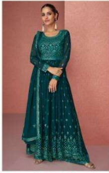
◆ 9394 ◆