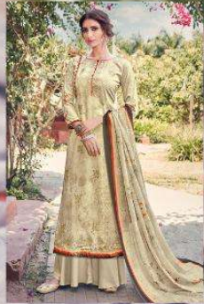
Code # 13803