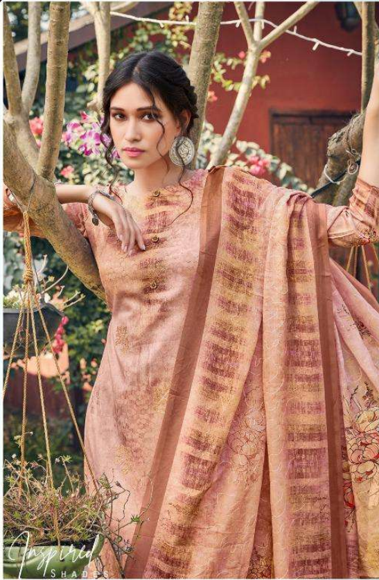
This season assortment brings your world noise too close to great looking colours and fantastic patterns...