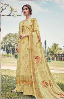
Code # 13805