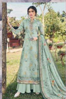
Code # 13807