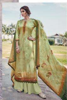
Code # 13808