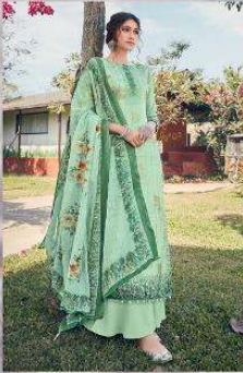
Code # 13801