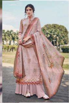
Code # 13804