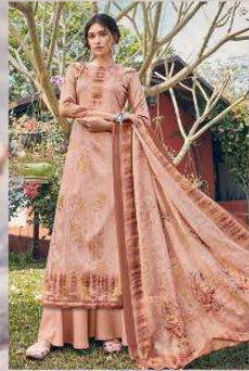
Code # 13802