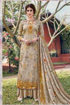
Code # 13806