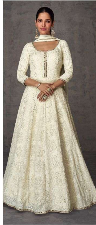
D NO : 5358