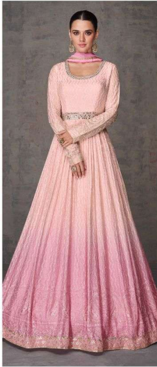
D NO : 5356