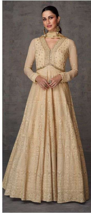
D NO : 5357